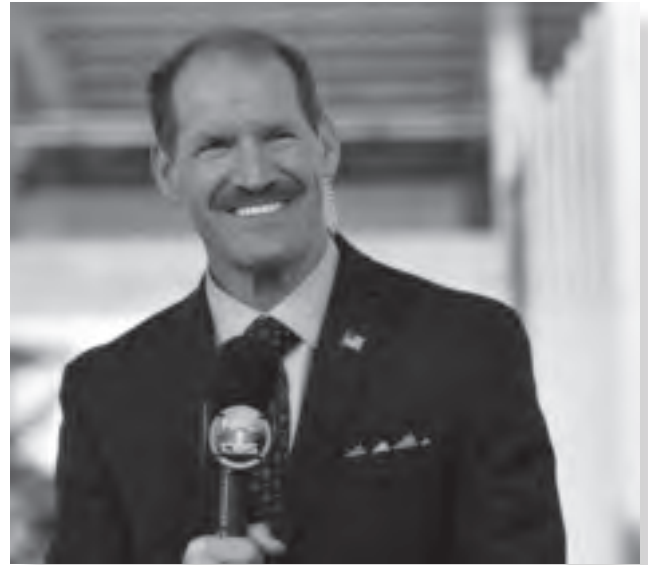
CBS Sports NFL TODAY analyst Bill Cowher visited American troops in Mosul, Iraq as part of the NFL-USO Coaches Tour in the Persian Gulf region in July 2009.

Since 1941, the USO has consistently delivered its special brand of entertainment and comfort to service men and women by