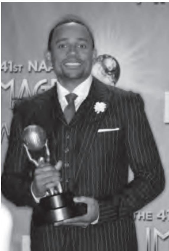
Hill Harper at the NAACP Image Awards.