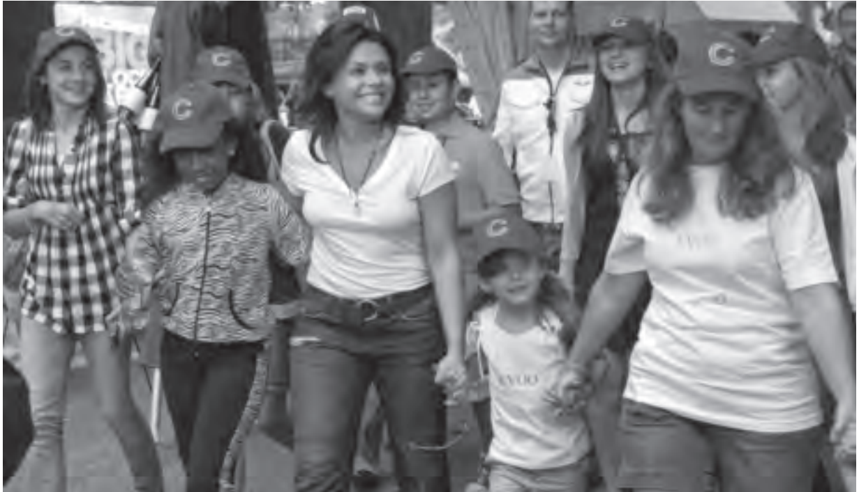
Celebrity chef Rachael Ray (C) at the "Chicago Block Party" season premiere episode of RACHAEL RAY on behalf of her Yum-o! Organization to highlight the importance of healthy eating and exercise.

at Home Wish Registry, which rallies Americans to provide gift cards for active-duty service men and women and their families during the holidays.