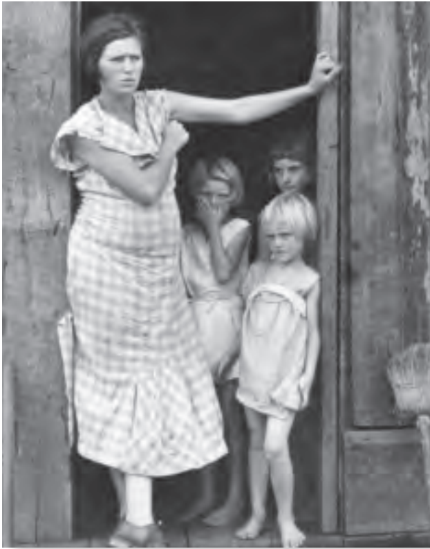
Depression-era photograph from the Smithsonian Channel program, SOUL OF A PEOPLE, that highlights the country's conflicting historical and sociological visions.

Smithsonian Channel, a joint venture between Showtime Networks, Inc. and the Smithsonian Institution, continues to educate viewers about important times in our nation's history and showcases scientific and cultural programming based largely upon the assets of the Smithsonian Institution, the world's largest museum complex.