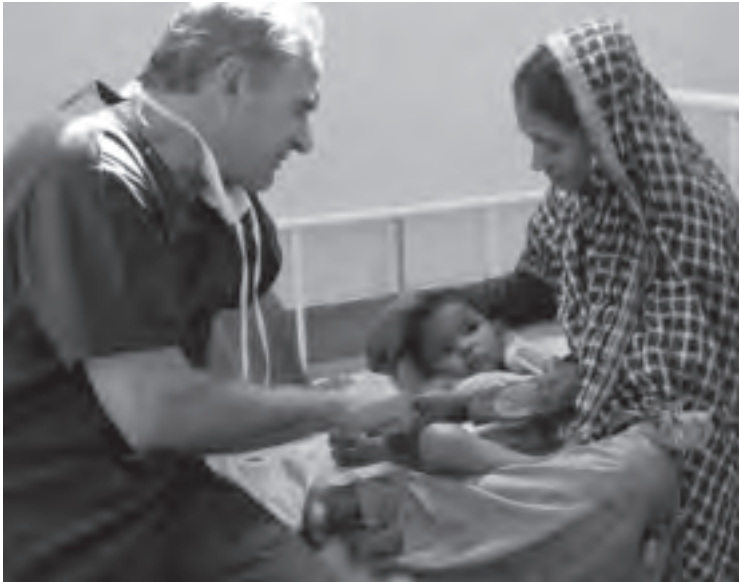
(Top) Dr. Andrew Ordon in India; (Top R) Dr. Travis Stork helping an earthquake victim in Haiti; (Bottom R) THE DOCTORS from L-R are: Drs. James Sears, Stork, Ordon and Lisa Masterson.