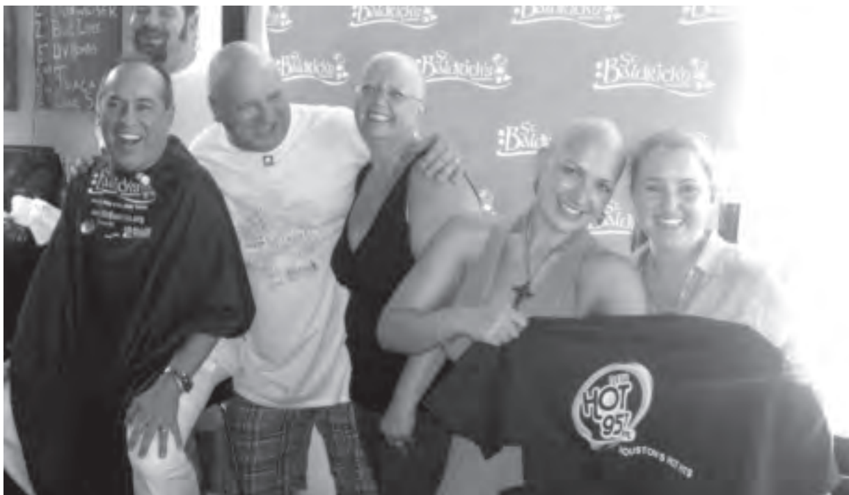
A group of 230 fundraisers who shaved their heads in support of children with cancer take a moment to smile as part of KYKY-FM’s “St. Baldrick’s Foundation Head Shaving Event.” In one day, the station helped raise $175,000.