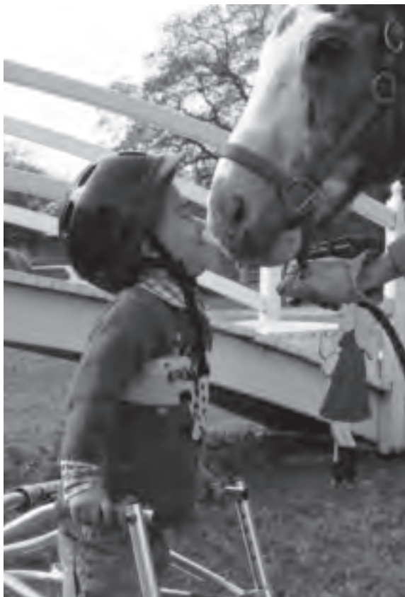
KTVT's half-hour special on Rocky Top Therapy Center in Keller, Texas, highlighted the physical and emotional benefits of therapeutic riding for special needs children.