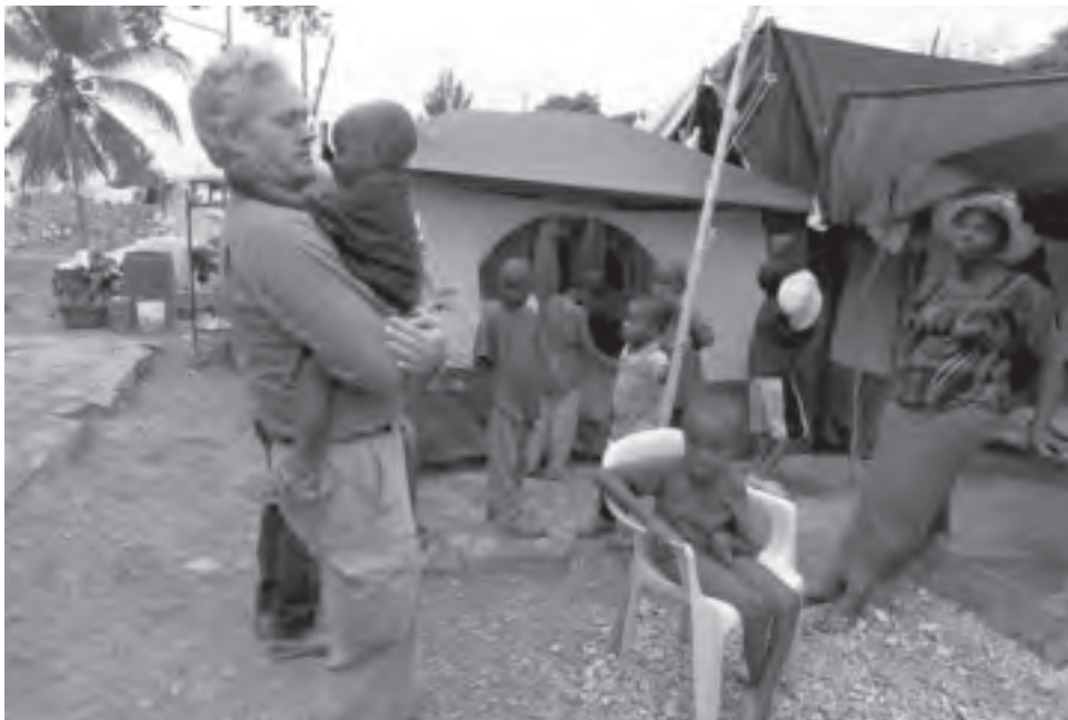
60 MINUTES' Scott Pelley (left) reported on the most vulnerable victims of Haiti's earthquake - children who not only face hunger, disease and sexual assault, but a form of slavery that is legal in the Caribbean country.