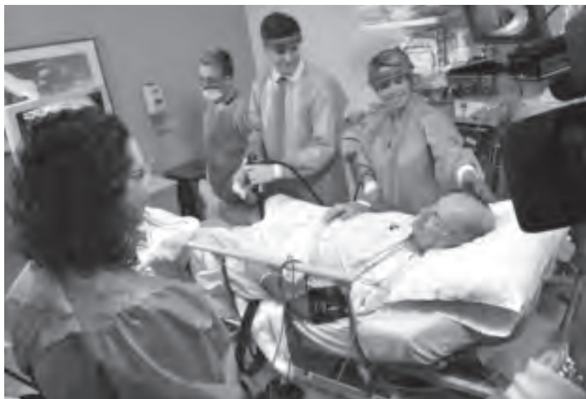
CBS EVENING NEWS anchor Katie Couric accompanied THE EARLY SHOW's Harry Smith during his colonoscopy, which was televised live on national television.

• EARLY'S ANGELS – THE EARLY SHOW found four people whose "good works" deserved on-air notice and a charitable contribution.