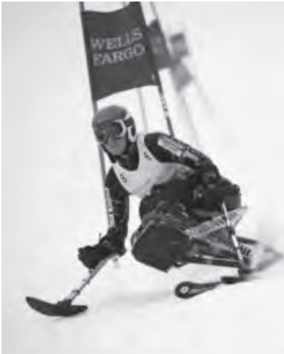
A disabled participant races at the National Sports Center for the Disabled's 2010 Wells Fargo Ski Cup in Winter Park, Colo., sponsored by KCNC in Denver.

together for a ski-racing weekend, benefitting therapeutic programs for adults and children. In 2009 and 2010, KCNC provided a full weekend of coverage from Winter Park, Colo., and highlighted the numerous programs offered by the NSCD. The event raised about $203,000 in 2009 and $206,000 in 2010