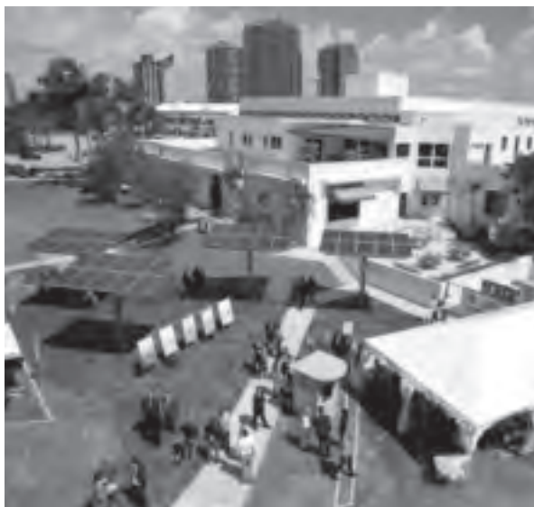
EcoMedia helped Miami's City Hall install solar panels on its rooftop.