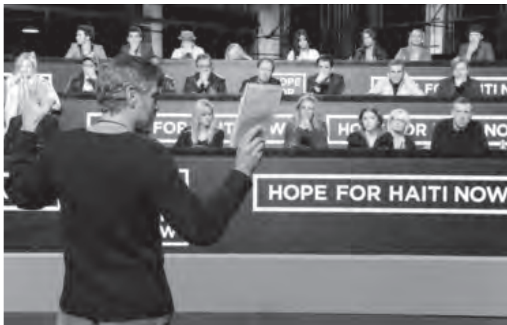
(Left) On Jan. 22, CBS and SHOWTIME aired George Clooney's two-hour "Hope for Haiti Now" telethon (Bottom) featuring a parade of stars, that included CBS's LL COOL J (right) and Neil Patrick Harris (left).