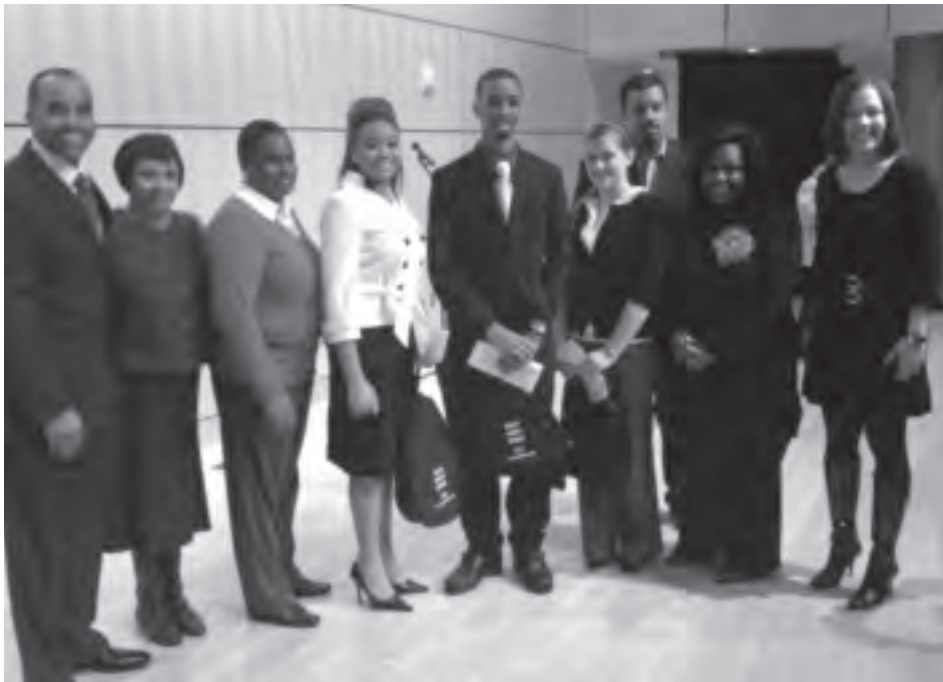
Winners of the 18th Annual WJZ's Black History Oratory Contest, which attracted more than 100 high school students from across the state of Maryland in 2010. Three finalists were selected by WJZ and a team of judges to win cash prizes and scholarships.

gram held in January 2010 included presentations from those in front of and behind the camera.