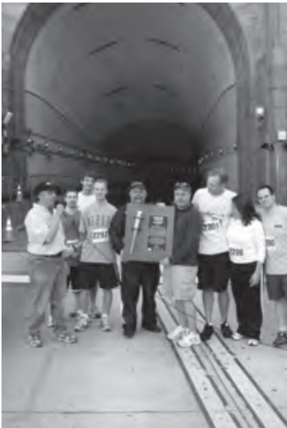
At the entrance of New York's Lincoln Tunnel for WCBS-AM's annual fundraiser benefitting New Jersey's Special Olympics.

dren's Specialty Healthcare and The MYTH in Maplewood to sponsor a "Mock Stock" concert in April, featuring six cover bands. More than 2,000 listeners came out for the event, helping raise $5,000 for Gillette Children's Specialty Healthcare.