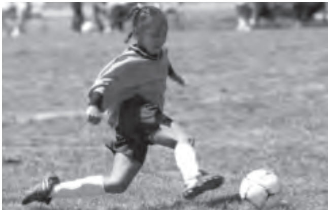
Chicago's 670 The Score helped local schools' athletic programs whose budgets were slashed in tough times

While many CBS RADIO stations concentrate their public service on fundraisers and charity drives, 670 The Score (WSCR-AM) used its muscle to help fund school athletic programs suffering from budget cuts.