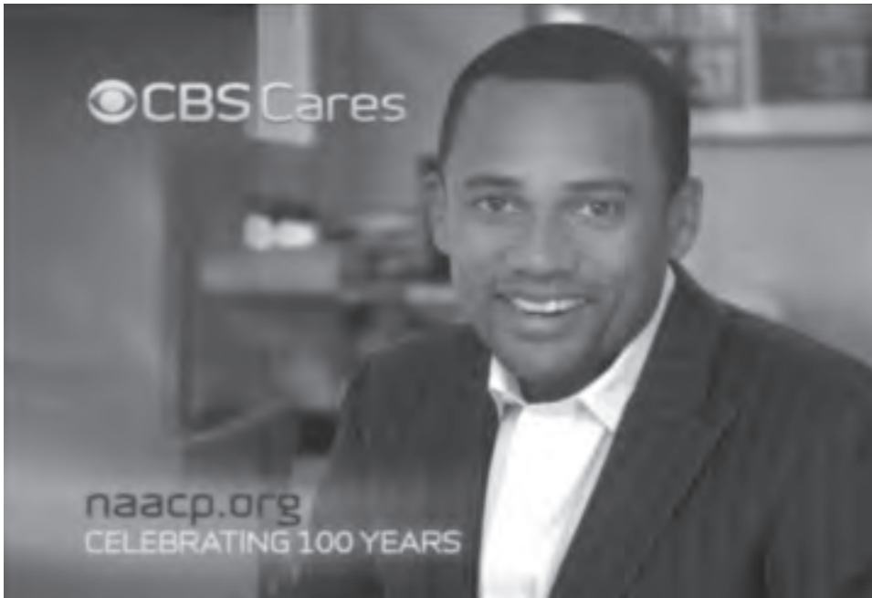
Hill Harper, star of CBS's CSI: NY, appeared in CBS Cares' series of PSAs developed in partnership with the NAACP to honor the 100th anniversary of the organization and its achievements.

Month, Hispanic Heritage Month and Native American Heritage Month. These PSAs featured CBS talent paying tribute to generations of diverse Americans who have enriched the country's history and urged viewers to celebrate these important commemorative months.