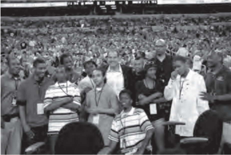
CBS Sports' lead college basketball announce team of Jim Nantz and Clark Kellogg are flanked by members of the Boys & Girls Clubs of America from Indianapolis-area high schools for a special "Final Four Experience."

• The CBS Sports Communications Department, along with the NCAA Division I Men's Basketball Championship Communications Committee, continued a new tradition started last year by volunteering at a local community center in the city hosting the NCAA Men's Division I Basketball Championship Final Four. This year the group volunteered at the Shepherd Community Center in Indianapolis.