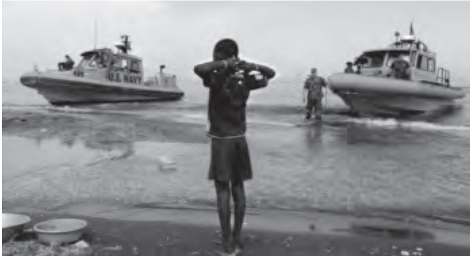
A Haitian boy watches as rigid-hull inflatable boats from the amphibious dock landing ships USS Fort McHenry and USS Carter Hall arrive ashore at the New Hope Mission in Bonel January 19, 2010.