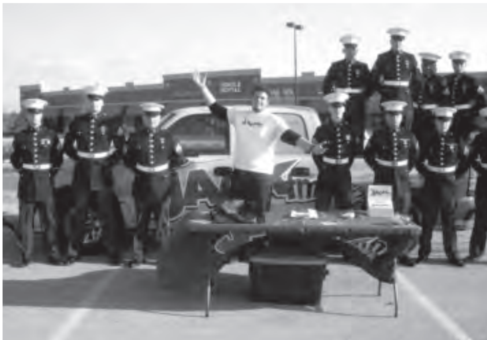
100.3 JACK FM's drive for the US Marines' Toys for Tots helped collect presents for under privileged children in the Dallas area.