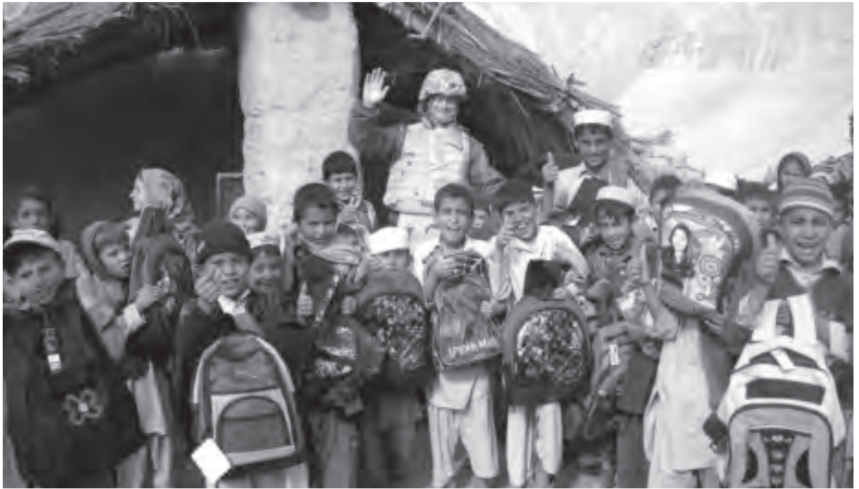
Gary Sinise (center) in Afghanistan delivering supplies to children, through his non-profit Operation International Children.

commendation from the Prism awards in the drama series/mental healthy category.