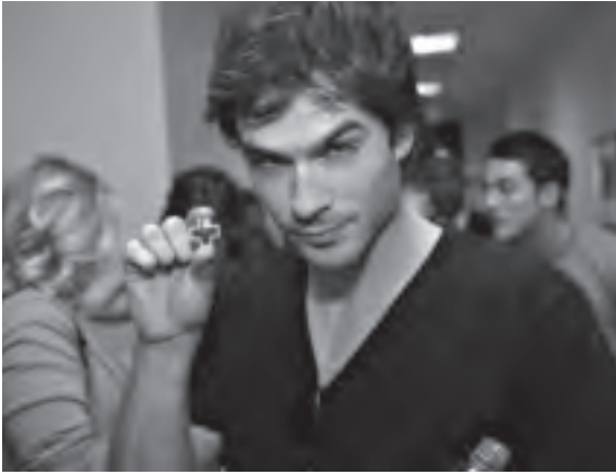
Ian Somerhalder, star of The CW's freshman hit THE VAMPIRE DIARIES , at a blood drive at high schools and colleges across the nation.